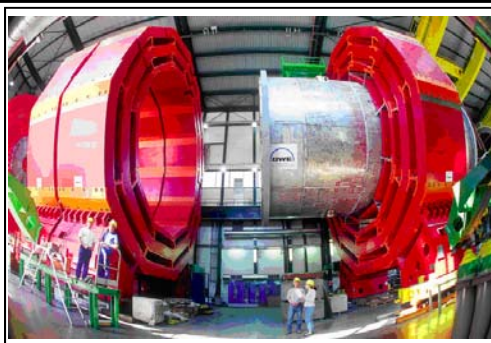
Experimentalists in France near CERN (European Organization for Nuclear Research, http://www.cern.ch ) in Geneva Switzerland start to assemble the CMS detector ( http://cmsdoc.cern.ch ). This detector will go into the beam line in 2007.