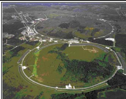
Aerial photograph of Fermi National Accelerator Laboratory ( http://www.fnal.gov ), near Chicago, Illinois. The circumference of a ring is 4 miles.