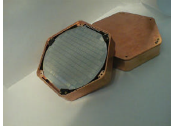
Figure 1. Picture of a ZIP detector from CDMSII webpage.

ZIP (Z-dependent Ionization and Phonon mediated) detector is a cylindrical high purity Ge or Si crystal that is 1 cm thick and 7.6 cm in diameter. A single Ge (Si) ZIP has a mass of 250 g (100 g). Two concentric ionization electrodes and four independent phonon sensors are photolithographically patterned onto each crystal.