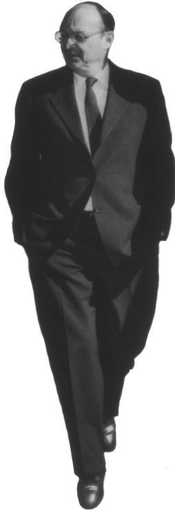
Fig. 1. John Bardeen.

About a week after I sent in a letter to the editor outlining these ideas. Fröhlich visited the Bell Telephone Laboratories where I was working at the time. He told me about his own work on a theory of superconductivity